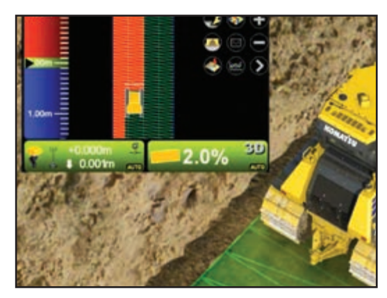
Surface track mapping: cab top GNSS antenna collects accurate "as-built" surface data. It measures actual elevations, as the machine continuously tracks in operation.