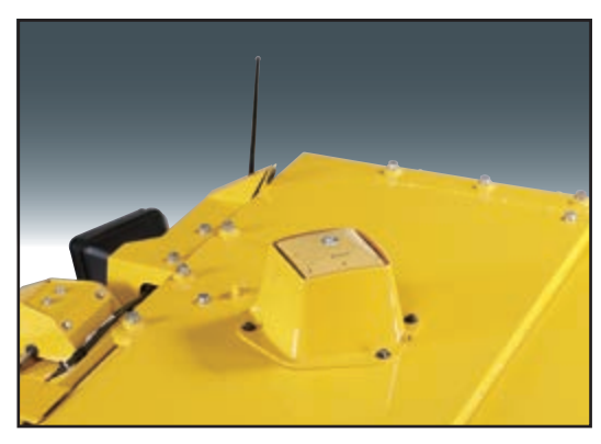
All components for machine control are factory-installed during assembly at the Komatsu manufacturing facility, ensuring reliability and high quality.