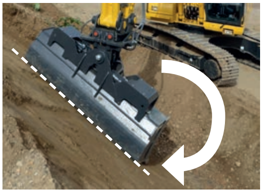
New Auto Tilt Control Automatically tilts bucket to design and returns it to horizontal to unload. Makes delivering final grade quicker and easier.