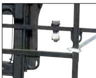
Easy access on both sides -Sliding bars-