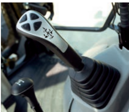
Convenient, ergonomic and precise control

A high-definition 7" LCD monitor provides excellent visibility. The high-definition LCD panel is less affected by the viewing angle and surrounding brightness, ensuring excellent visibility. Various alerts and machine information are displayed in a simple format. Useful information such as operation records, machine setting and maintenance data are also provided. The operator can easily navigate through screen pages with intuitive side buttons.