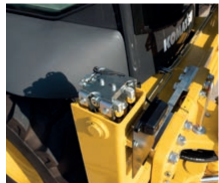
Anti-burst valves for stabilizers, boom and arm (Standard)