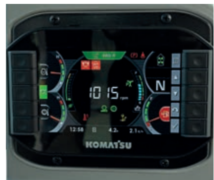
New 7" multi-function monitor