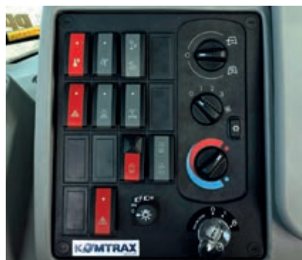
Ergonomically designed switches