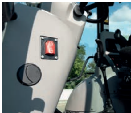
Secondary engine shut down switch